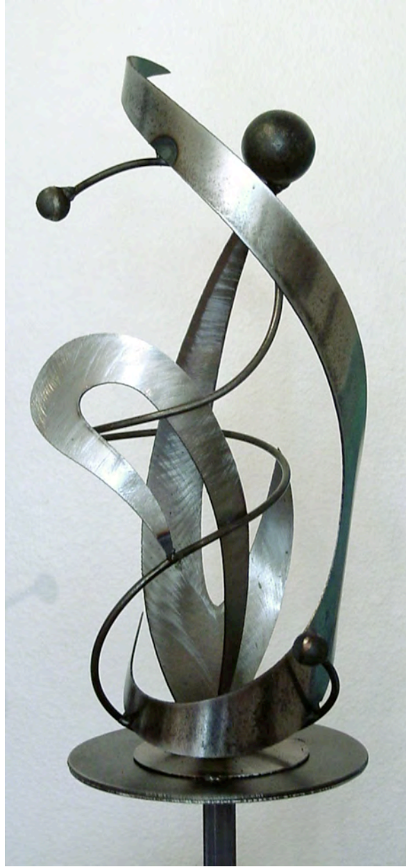
Left: Maquette/Collaboration - Particle and the Wave 1, 6"w x 23"h x 7"d Powder coated steel 2011 Collaboration with sculptor Doug Hays