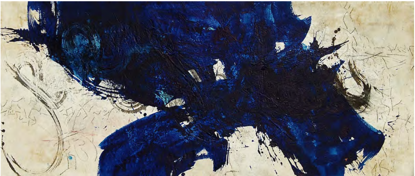
Top: Broken Circle Series - Crossroads, 58" x 3' Acrylic, enamel, Sumi ink on canvas 2011