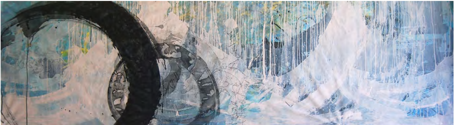
Top: Walking Sticks, Bird, Ocean Wave, 2 panels 20" x 15" ea. Acrylic, India ink on watercolor paper 2011