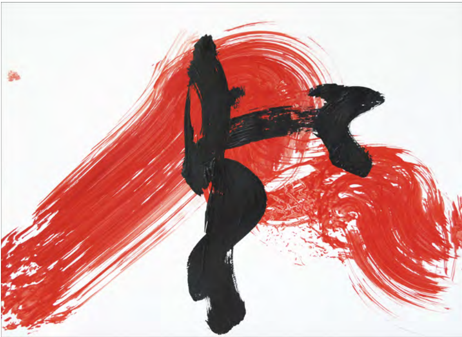
Top: Ink Mark - Ox , 30" x 22" Acrylic, Sumi ink on watercolor paper 2013