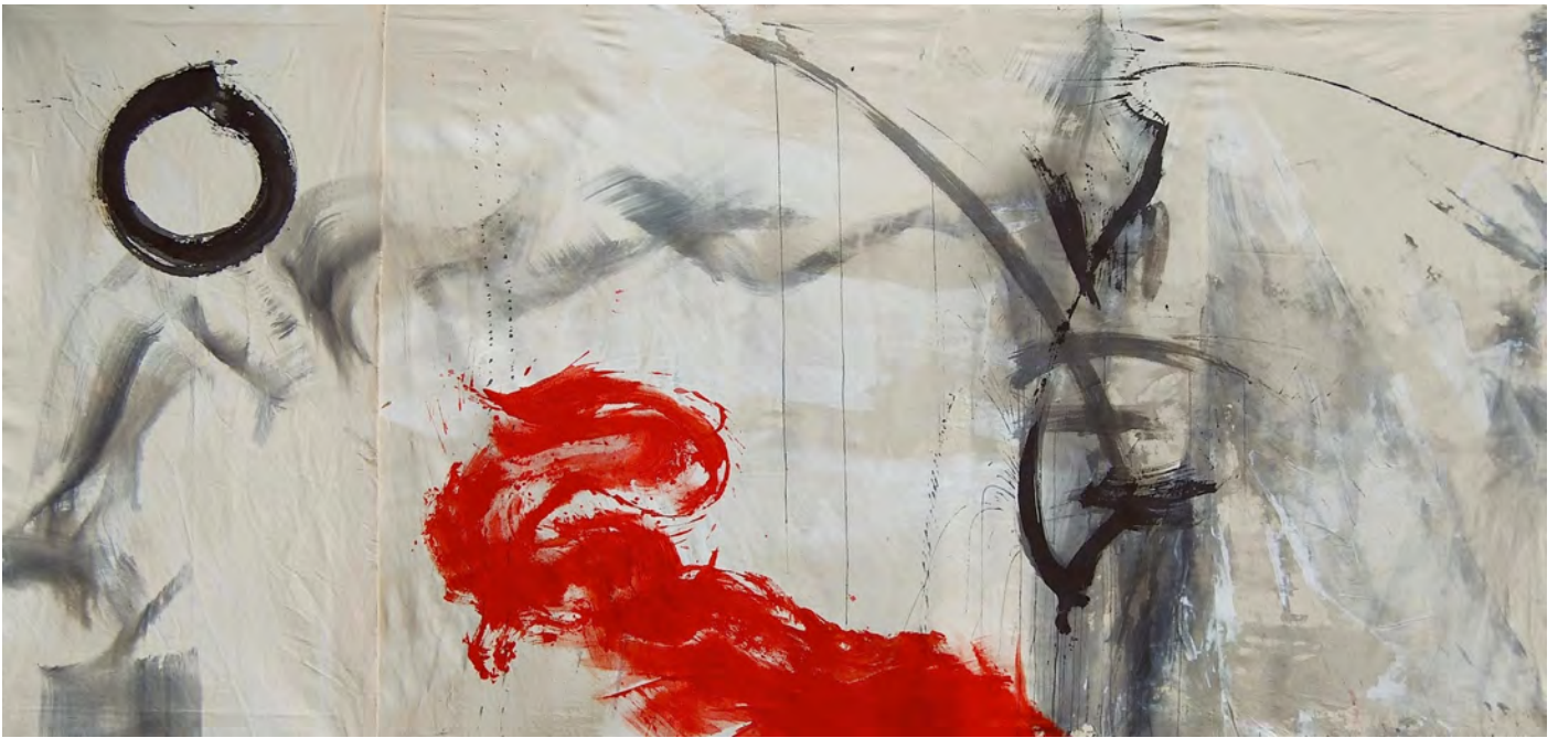
Top: Walking Meditation Blue #1, 5'6" x 25" Acrylic, Sumi ink, metallic powder on linen 2013