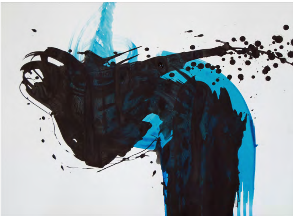
Top: Enso Black with Blue Brush, 30" x 22" Acrylic, Sumi ink on watercolor paper 2013