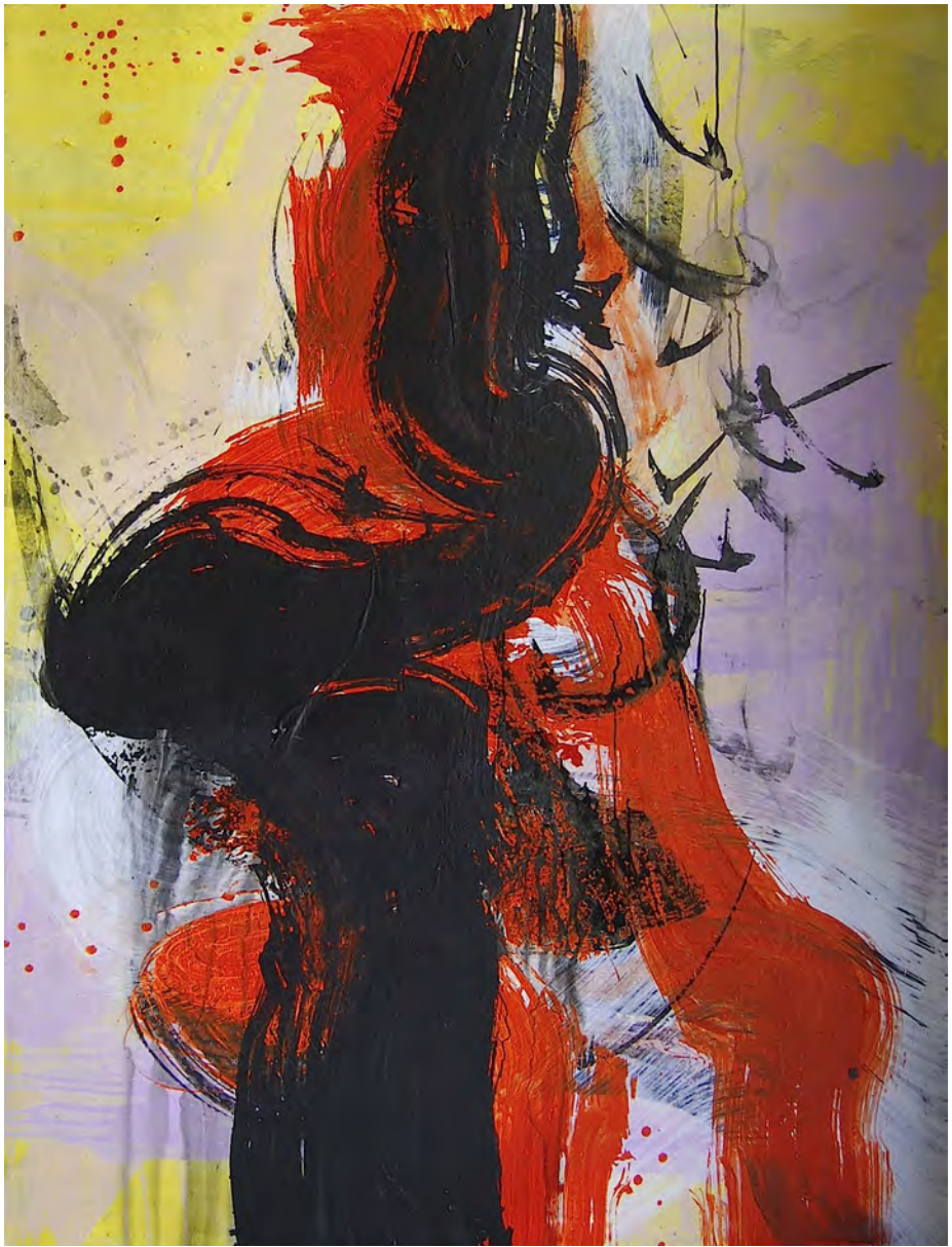
Way of the Brush - Lavender Red/Orange, 49" x 5'4" Sumi ink, acrylic on canvas 2013/12