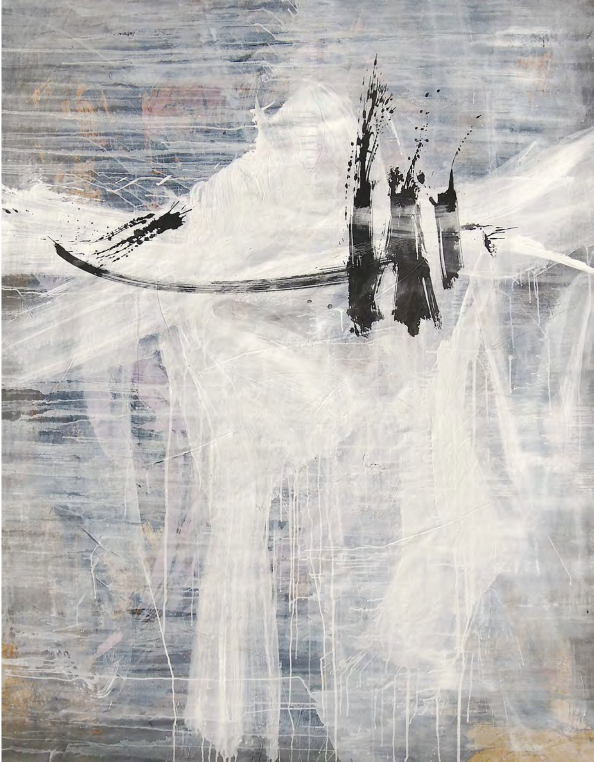
White Samurai , 5' x 7'6" Sumi ink, acrylic on canvas 2012/11