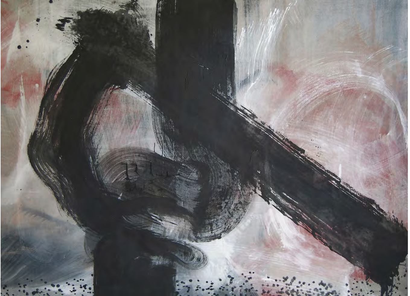
Way of the Brush 1 , 7' x 5'2" Acrylic, Sumi ink on canvas 2013