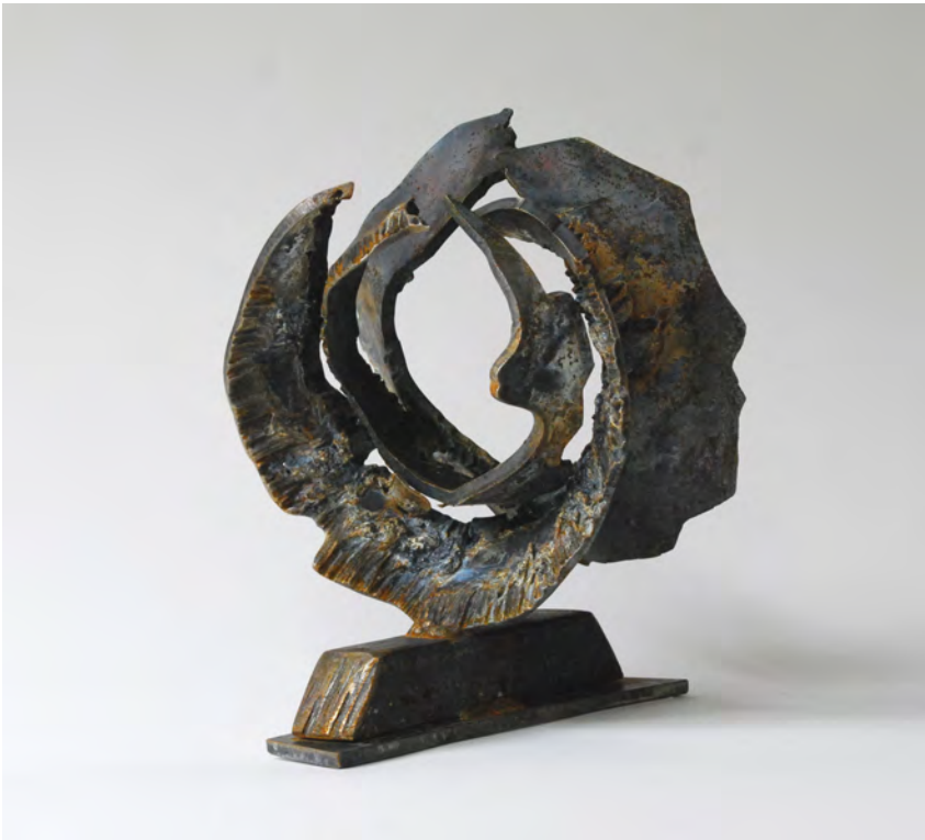
Top: Enso 7 - 2nd Generation, 10"h x 8"w x 5"d, Steel, natural patina 2013