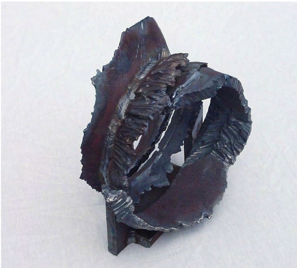
Enso Circle Sculpture 1 - 1st Generation / Maquette, 10"w x 11"h x 6"d, 1/2" plate steel, natural patina 2012