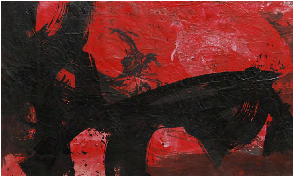
Top: Red Samurai Black Enso, 4'10" x 32" Acrylic, Sumi ink, silver/gold metallic powder on raw canvas 2013