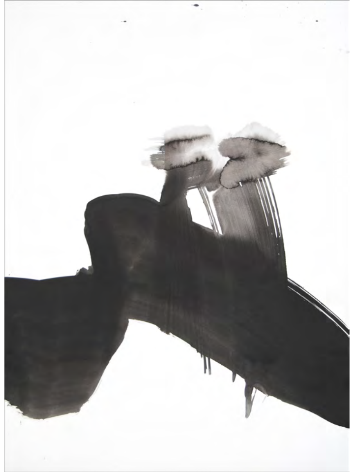
L: Way of the Brush - Cyan , 4' x 6'5" Sumi ink, acrylic on canvas 2013/12