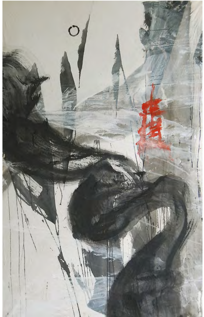
L: Precarious Enso , 41" x 4'10" Acrylic, Sumi ink on raw canvas 2013/12