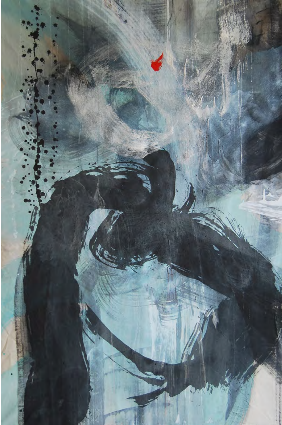
Walking Meditation Blue #2 , 3' x 4'3" Sumi ink, acrylic, oil stick, metallic powder on canvas 2013