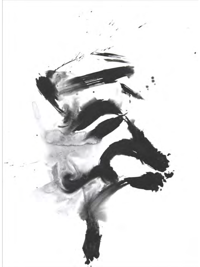
Companions , 2 panels - 22" x 30" ea., Acrylic, Sumi ink on watercolor paper 2013