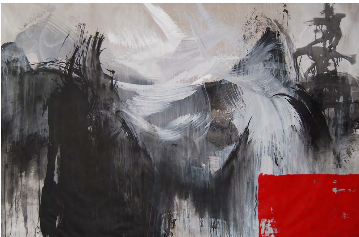
Top: Red Square 3, 6'3" x 4'2" Sumi ink and acrylic on canvas 2013 Sept/Aug