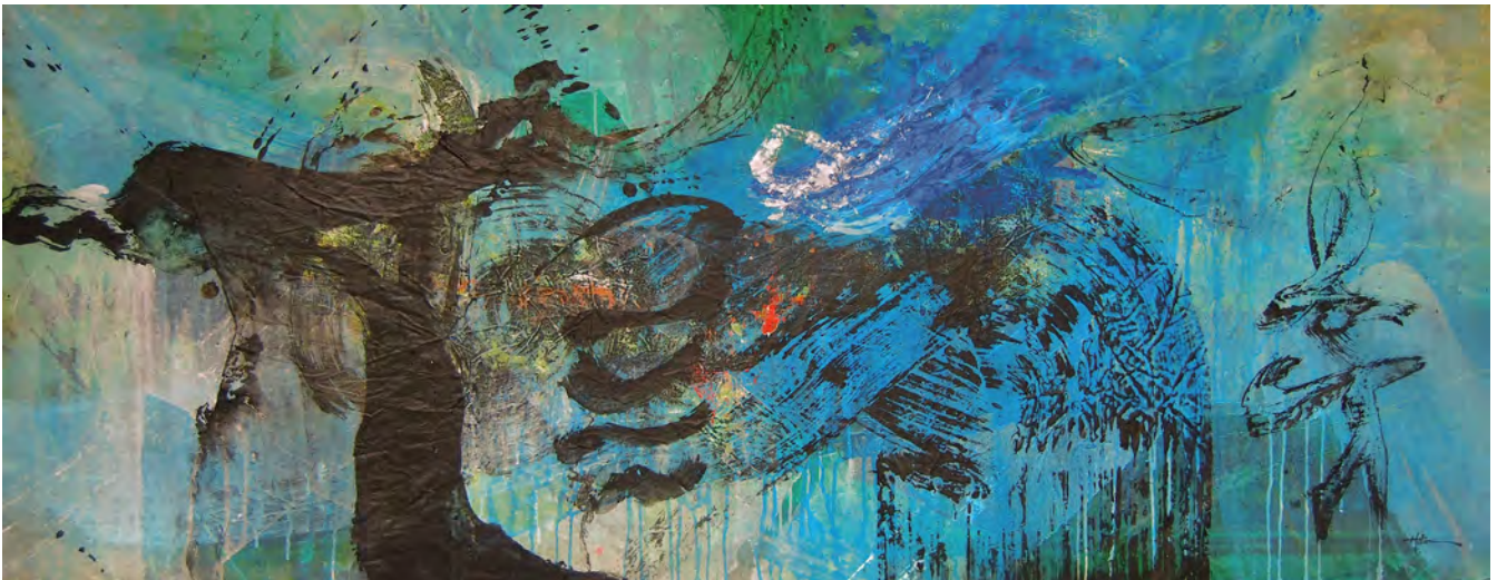
Top: Walking Ink , 6' x 4'2" Acrylic, Sumi ink on canvas 2013/12